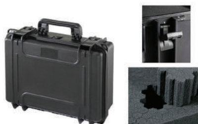
Safety baggage with a dense interior foam.