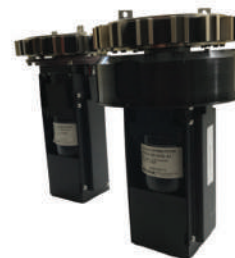
Motor Robot HP on upper/lower assembly HP..